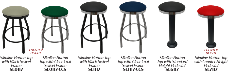
Slimline Button Top with Black Swivel Frame SL0117

You may also like Oak Street Manufacturing's other Slimline Button Top Barstool Options: