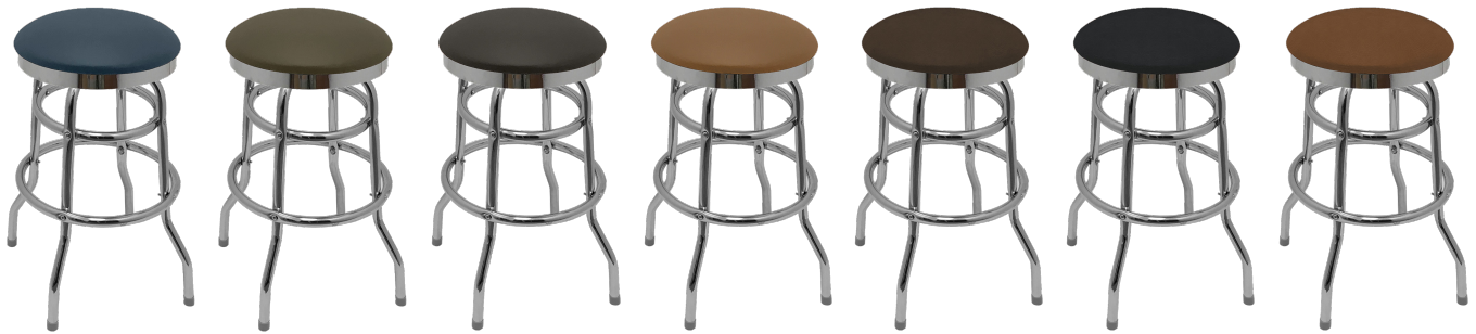
Blue Ridge SL1131-BR