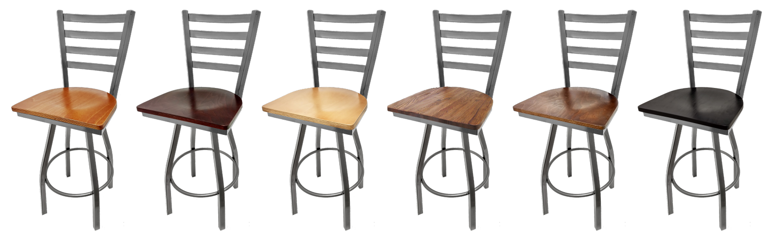
Cherry stain Wood Seat Mahogany stain Wood Seat SL135C1-S-CH