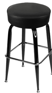
Button Top with Gloss Black Square Frame SL2135