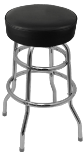
Button Top with Double Rung Chrome Frame SL2129

You may also like Oak Street Manufacturing's other Button Top Barstool Options: