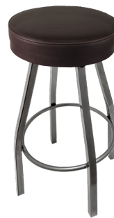
XL Button Top with Clear Coat Swivel Frame SL3132-CCS