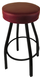
XL Button Top with Black Powder Coat Swivel Frame SL3132