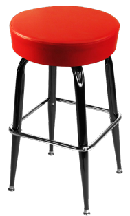
XL Button Top with Gloss Black Square Frame SL3135