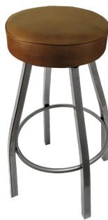
Button Top with Clear Coat Swivel Frame SL2132-CCS