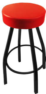
Button Top with Black Powder Coat Swivel Frame SL2132