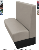
Tier 4 (-T4) [specify]