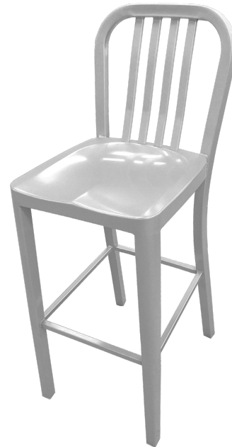
Navy Barstool BM-252-ALM