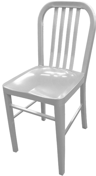
Navy Chair CM-252-ALM