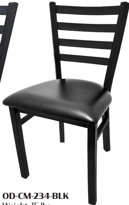
OD-CM-234-BLK Weight: 15 lbs