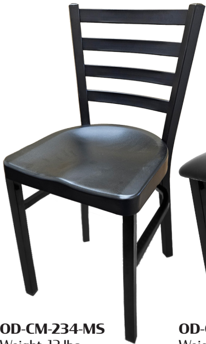
OD-CM-234-MS Weight: 12 lbs