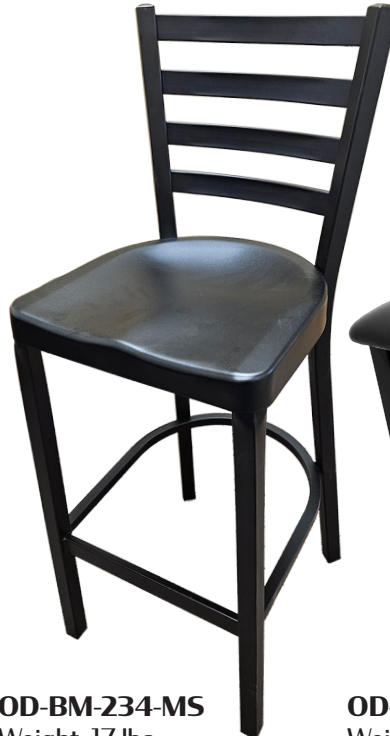
OD-BM-234-MS Weight: 17 lbs