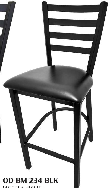
OD-BM-234-BLK Weight: 20 lbs