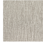
Light Moss upholstery